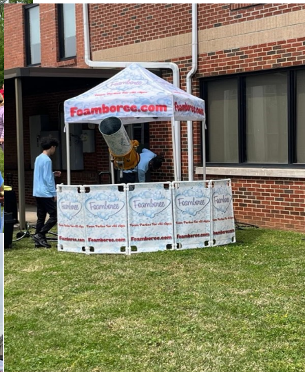
BIG crowd enjoyed a great Egg Hunt and the Foamboree!