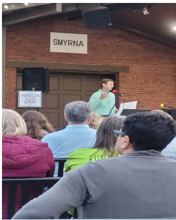
Sunrise Service at the Depot always draws a crowd.